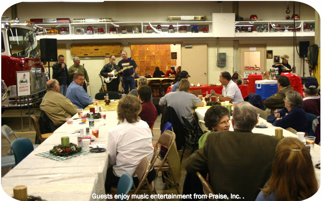
Guests enjoy music entertainment from Praise, Inc. .