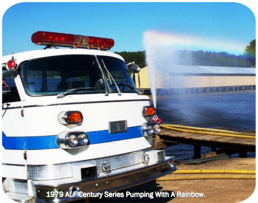
1979 ALF Century Series Pumping With A Rainbow.

Congratulations go to the following award winners: Longest Distance Traveled-Bill Wilcox's 1900s Hose Cart; Oldest Motorized Apparatus-John Fuston's 1932 GMC Shop Built