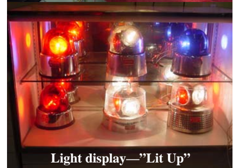
Light display—"Lit Up"

We hope to have the new web pages finished within the next few months. The website will be extensive and will be a unique opportunity for those who live outside the Dallas metroplex to experience the Texas Fire Museum from their own computer.