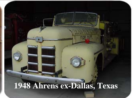
1948 Ahrens ex-Dallas, Texas