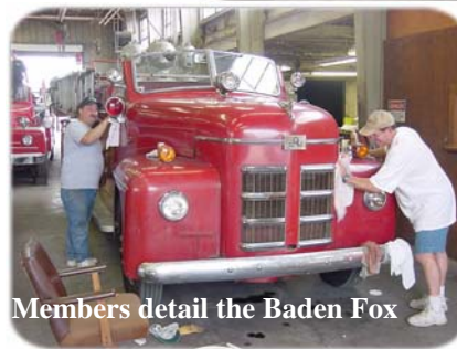
Members detail the Baden Fox